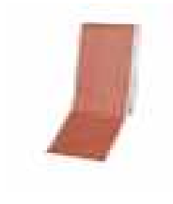
Dressings, Plasters, Bandages