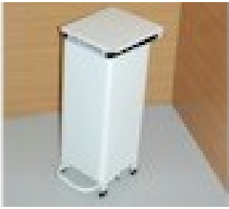
Free Standing Bodied Sack Holders