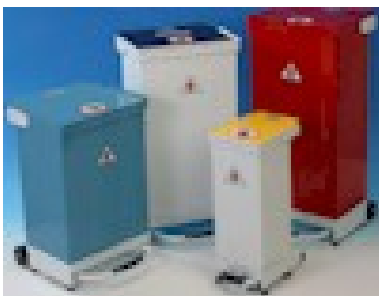
Metal Bodied Sack Holders