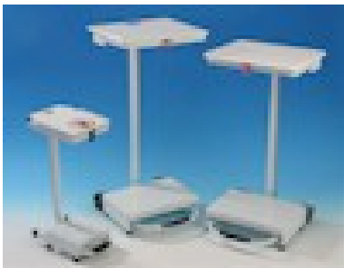
Free Standing Open Sack Holders