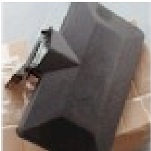
Wall Mounted Sack Holders